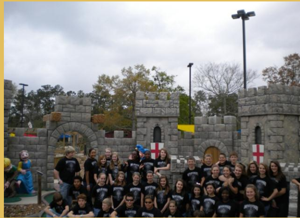
Last year, over 3000 Students from Southeast Texas visit Adventure Kingdom. Winners of Best Family Entertainment for 2008, 2009, 2010 and 2011.

Dear Superintendents, Principals, and Teachers: Several teachers have requested that we write and give their principals an overview of our facility, Adventure Kingdom. We also wanted to personally assure that we will give your students not only a clean safe environment to celebrate a great year of accomplishments, but also an educational experience. We are a renaissance themed family entertainment park with an original 1932 log cabin on the premises. This gives us the unique ability to educate children in two very diverse periods. We have developed a curriculum for each time period. The first is our frontier life curriculum. This helps students understand the daily life of an early settler in the Southeast Texas region, and how log cabins were constructed. The renaissance curriculum will take the kids overseas and to the days of knights and castles, and lore. We have age appropriate fun facts to share with the students to give them a feel of how the lowliest person to the King of the land would have lived on day to day basis. We encourage you and your personal family to come out and get a guided tour of our facilities.